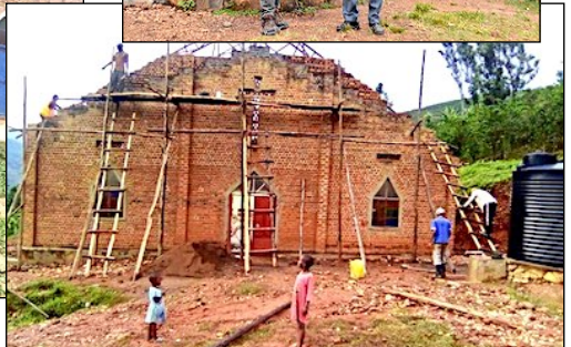
Right: WHPs installed and working in parishes of: Muhura (tr), Kinyana (bl) Gitenga (br)