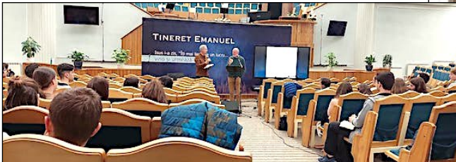
Right: Youth meeting, church service and church leaders' seminar.